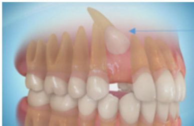
Identification of the impacted tooth