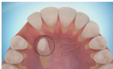
Gum lifted from the impacted tooth