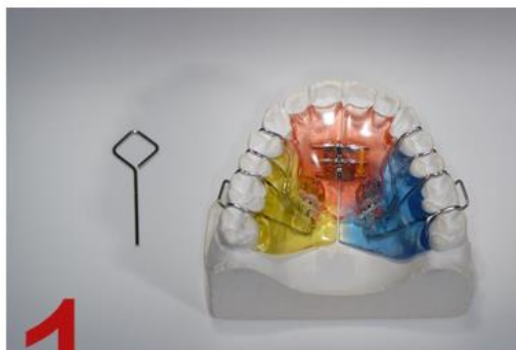
1 URA with key.

To create expansion with your URA, you will be required to use a key (or keys) to adjust your plate on a weekly basis, according to your doctor's instructions.